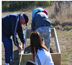
Volunteers building raised beds