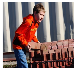
Moving bricks for flower garden