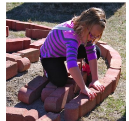
Arranging bricks for flower garden