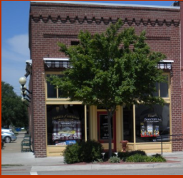
The Collinsville Main Street Office

Earlier this month, the Oklahoma Main Street Center announced the finalists for 20 competitive awards. All finalists will be honored, and the winners in each category will be announced May 7th at the 24th annual Main Street Awards Banquet to be held at the National Cowboy and Western Heritage Museum in Oklahoma City.