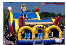
Photos from Hogs'n'Hot Rods 2012